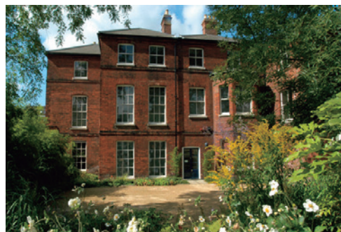
Sainsbury Institute for the Study of Japanese Arts and Cultures