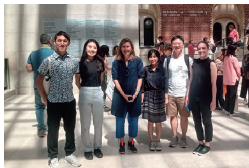
Ishibashi Foundation Digital Futures Project

Ishibashi Foundation 1-7-2 Kyobashi, Chuo-ku, Tokyo 104-0031 www.ishibashi-foundation.or.jp