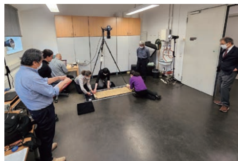
Research at the GRASSI Museum of Ethnology in Leipzig (2023)